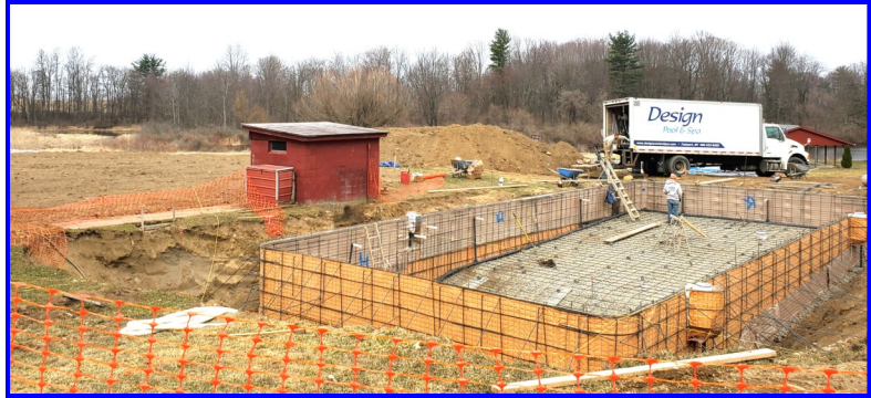
The old pool is buried, the new one takes shape!