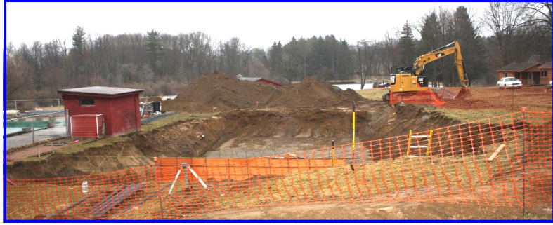
Digging begins thanks to Genesee Construction!