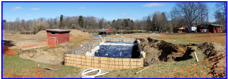
Please pray with us that work can resume soon and the pool be completed in time for campers!

NON-PROFIT ORGANIZATION U.S. POSTAGE PAID BUFFALO, N.Y. PERMIT NO. 3479